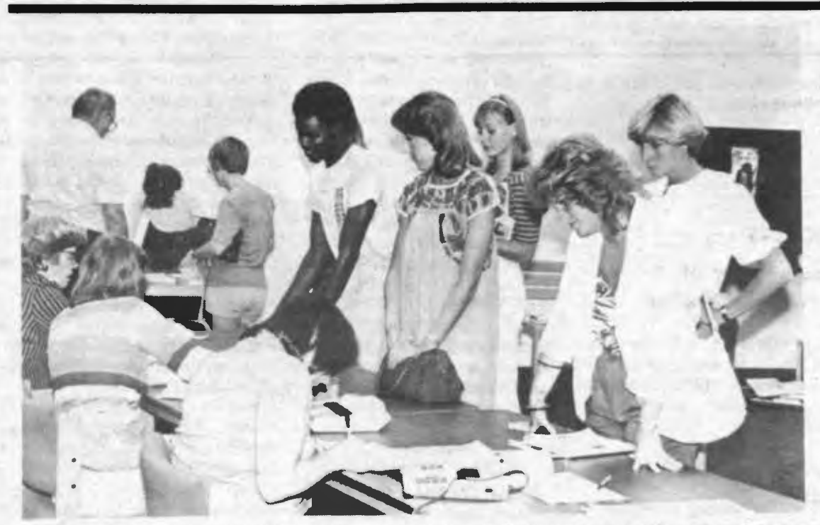
JUST A FEW of the record enrollment of summer session students, as they went through registration lines June 1-2.