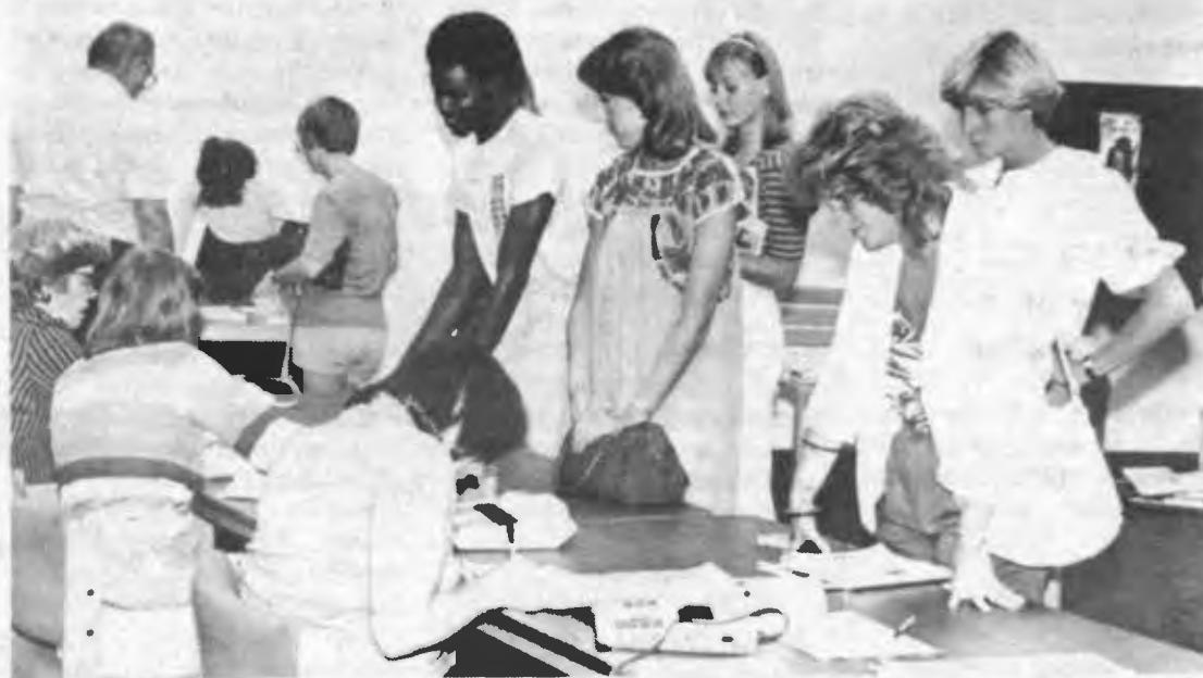
JUST A FEW of the record enrollment of summer session students, as they went through registration lines June 1-2.