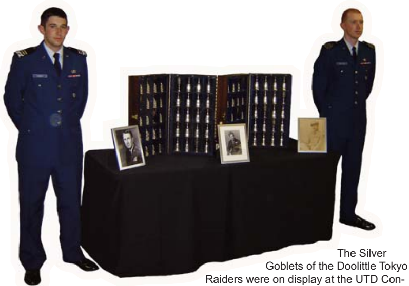
The Silver Goblets of the Doolittle Tokyo Raiders were on display at the UTD Conference Center during the Raiders presentation on April 19. Here the gob-

lets are guarded by U.S. Air Force Academy cadets at UTD. The goblets were presented to the Raiders by the City of Tucson in 1959. There is an enscribed goblet for each of the 80 airmen who flew on the daring April 18, 1942 mission. Each year the surviving Raiders hold a solemn ceremony and turn over the goblets of their comrades who have died during the past year. They are kept permanently at the U.S. Air Force Museum in Ohio.