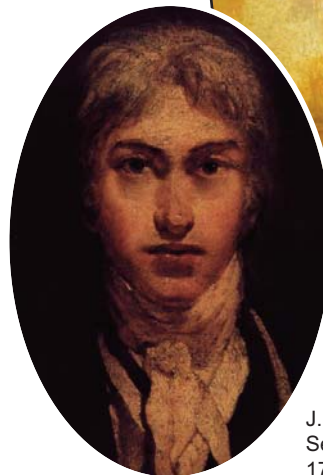
J.M.C. Turner Self portrait 1799

Famous for his landscapes, Turner (1775-1851) was known as the "painter of light" and "The Man Who Set Painting on Fire."