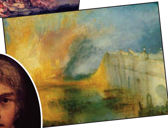
The Burning of the Houses of Parliament