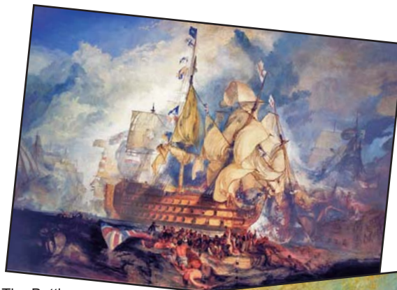
The Battle of Trafalgar

Famous for his landscapes, Turner (1775-1851) was known as the "painter of light" and "The Man Who Set Painting on Fire."