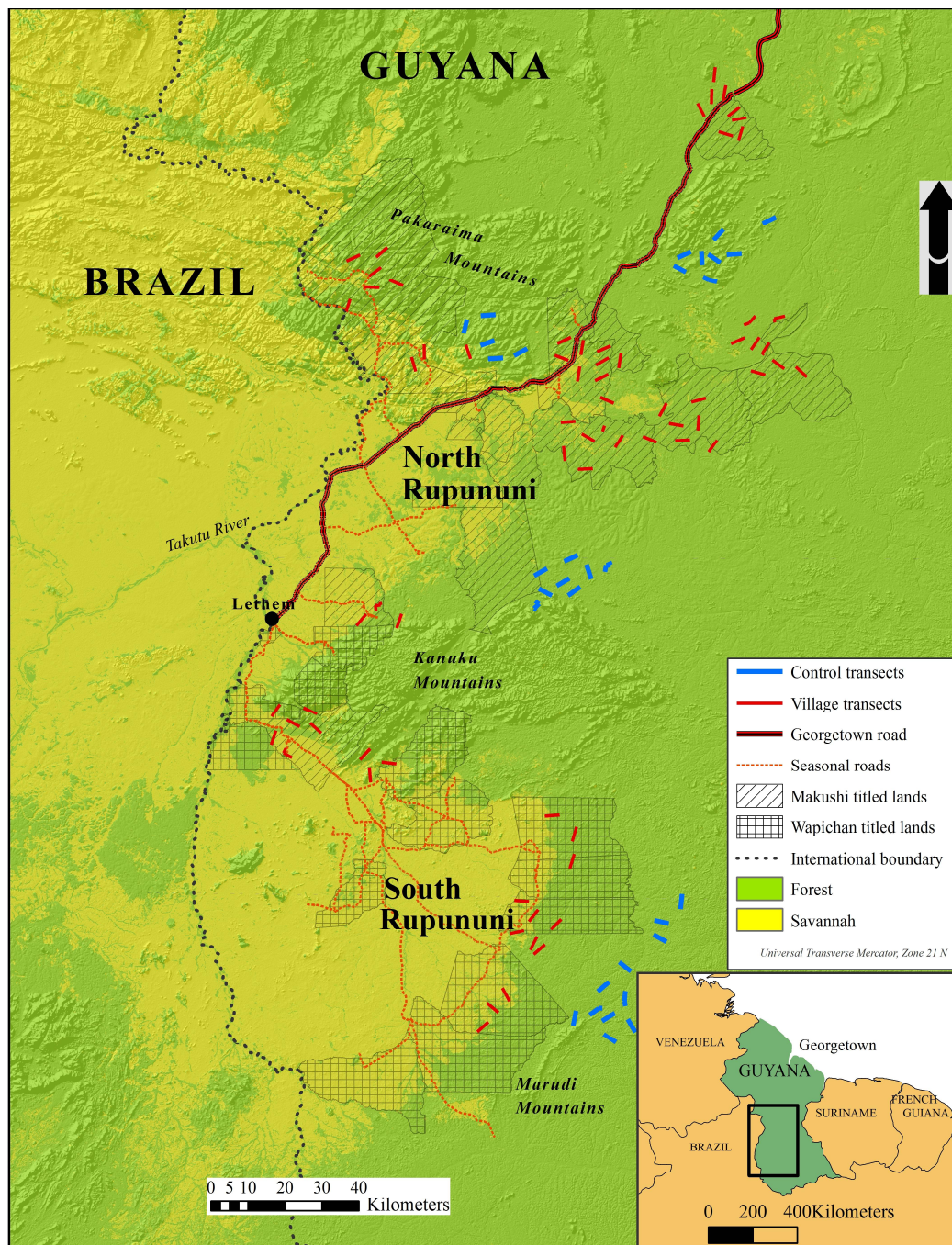
Figure 1. Study area with savannah and forest cover, indigenous titled lands, and village and control transects where biomass was estimated.

The Rupununi consists of a mostly flat-to-undulating landscape (~150 m above sea level, with mountain peaks up to 1000 masl) of tropical forest with defined boundaries to natural grassland savannah with scattered stunted trees, interspersed with small forest ‘islands’, and Mauritia flexuosa L.f. palms along creeks (more details in [34,35]).