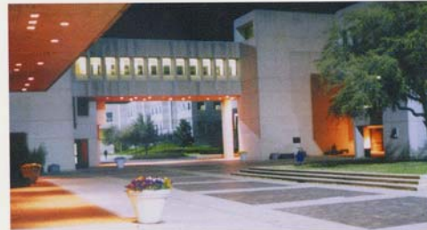
UTD at night