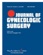
Journal of Gynecologic Surgery