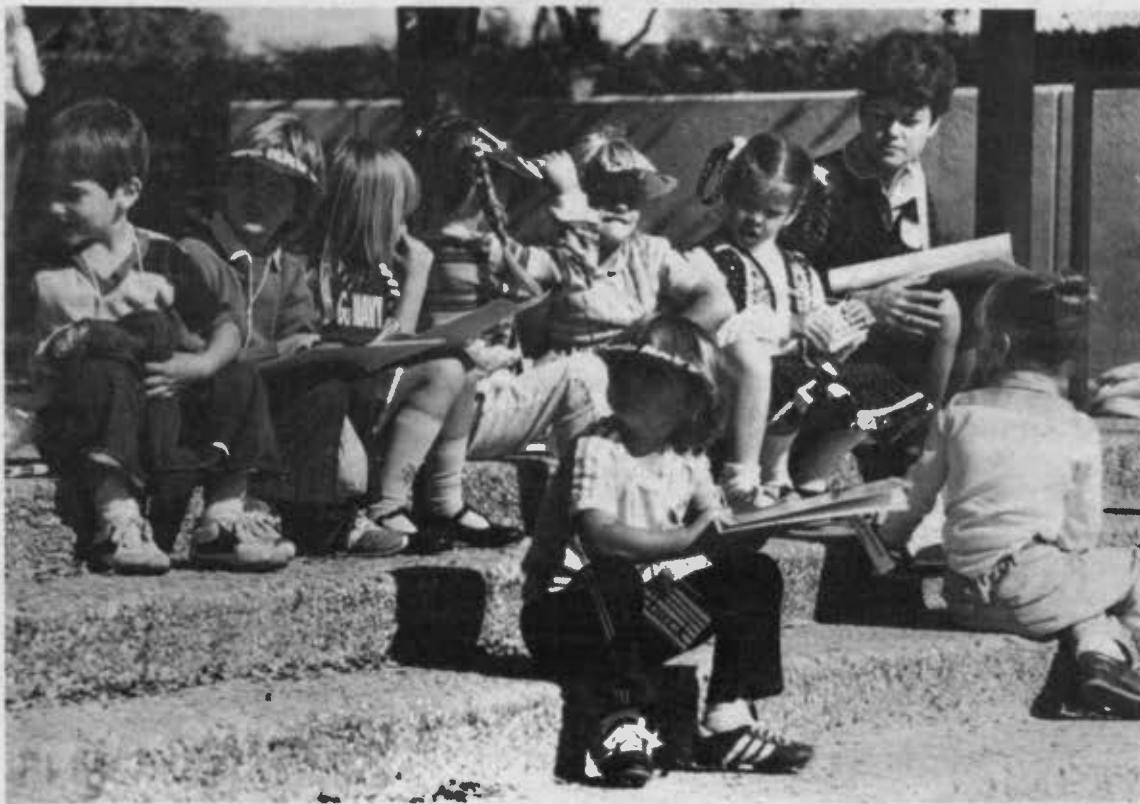
Elementary school children and their teachers came to watch Veterans Day activities on the mall Nov. 11.

The Student Newspaper of The University of Texas at Dallas